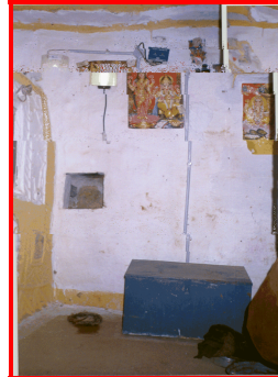
DLS IN HUT AT JAISALMER

This system provides un-interrupted light and is completely noiseless, smoke-free and free from fire hazards. The independent lighting system consisting of 2 CFL fixtures, a storage battery powered by the SPV Module provides 4 hours of light per day.